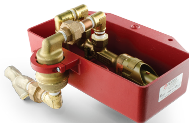
Automatic Air Vent with Drip Pan PAAR-B

View more information about the Potter Automatic Air Vent, including Engineering Specs Visit: pttr.us/PAV