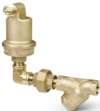
Automatic Air Vent PAV