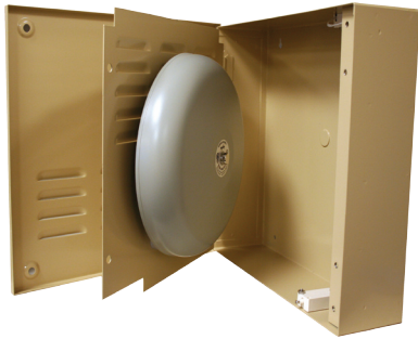
ABB-1014 OUTDOOR SLIMLINE STEEL BELL BOX