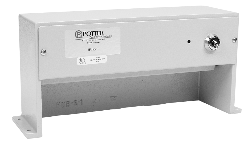
Stock No. 2020019